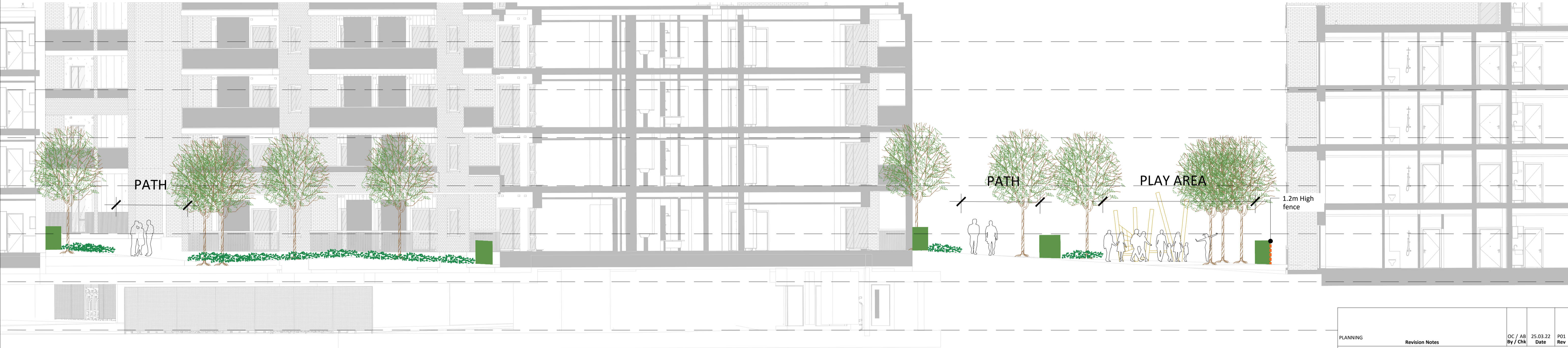
02 Landscape Section 05 Sectional Elevation Scale 1:100